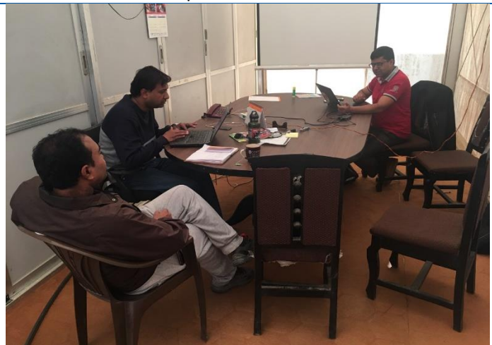
Meeting with World Vision