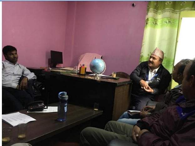
Discussion on coordination meeting with acting executive officer in Jugal gaupalika