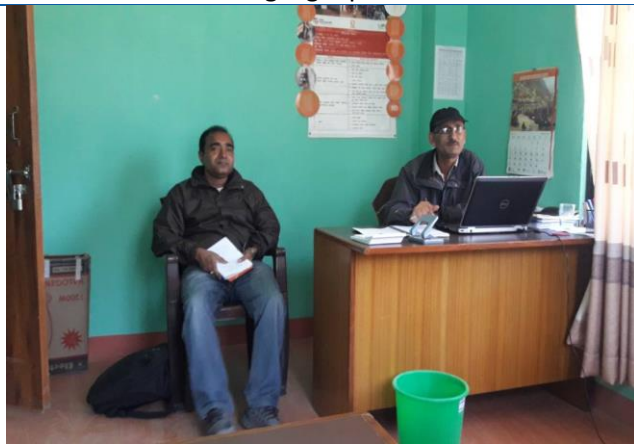
Meeting with CARE-N