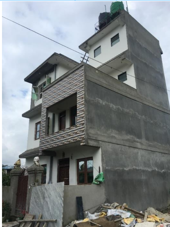
Ward No.9, Chandragiri Municipality, Kathmandu: three storey, RC frame structure. Lumanti are providing support to the home owner who had faced issues due to conflict regarding ownership of the land but has now been able to proceed with the housing reconstruction grant process.