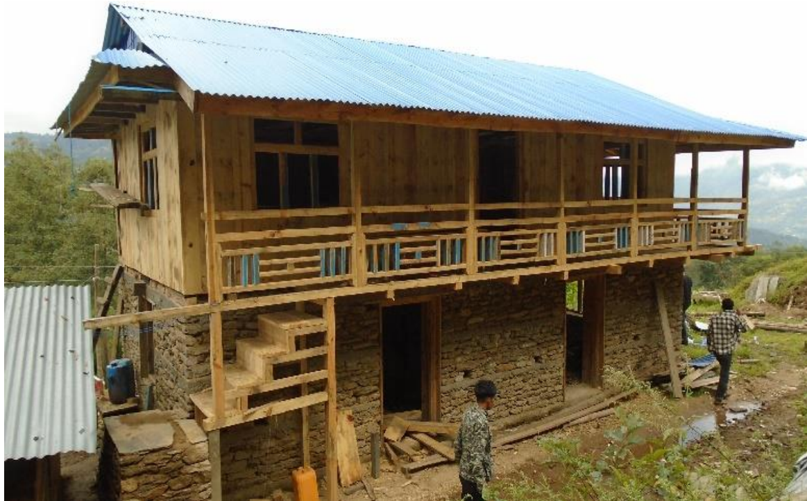
Ward No.3, Jiri Municipality, Dolakha: a hybrid structure with ground floor construction of stone and mud mortar masonry and first floor built with timber. The home owner has received all three tranches of the GoN housing reconstruction grant.