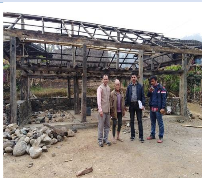
Caption: Timber structure building Belghari ward no-01 of Tinpatan Rural Municipality of Sindhuli district. Construction of this house is up to DPC level and beneficiary is waiting for design drawing for timber structure.