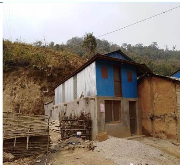
Caption: Hybrid structure building in Bahun Tilpung, ward no-08 of Tinpatan Rural Municipality of Sindhuli district. Construction of this house is completed and beneficiary has not got yet government 2 nd tranche due to Elani land.