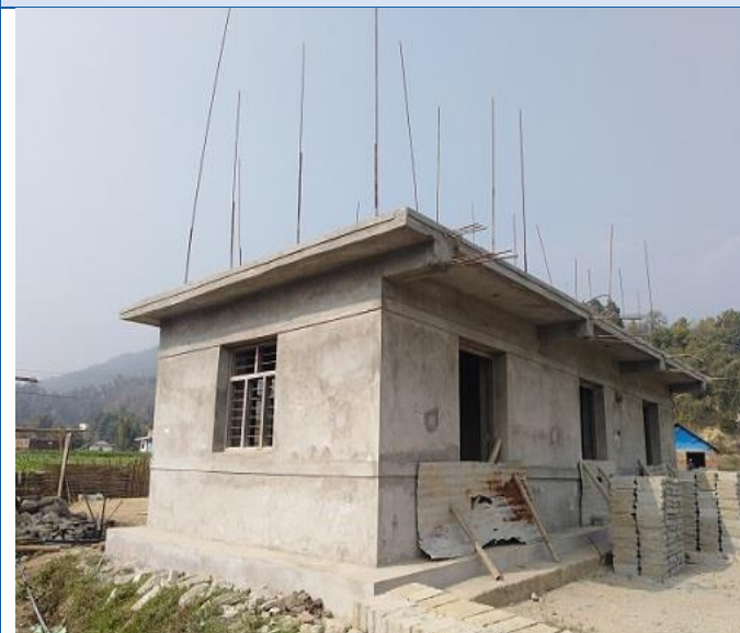
Caption: Brick masonry structure building in Bhimsthan ward no-02 of Tinpatan Rural Municipality of Sindhuli district. Construction of this house is completed and beneficiary is waiting for government 3 rd tranche.