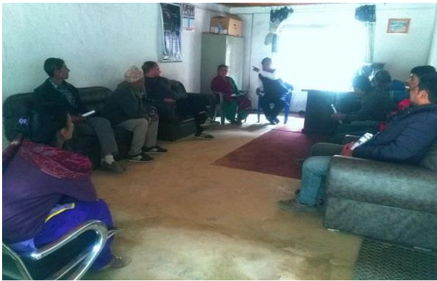
Figure 2: Technical Coordination Meeting in VDC level Indrasarowar Rural Municipality-01 (Previous Marphu VDC). There were 13 participants from Local Representatives, local government bodies, NRA Makwanpur, MoUD M&E Specialist, HRRP-DTC, NRA Technicians and Beneficiaries.