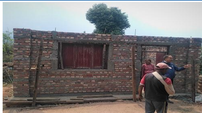
Figure 3: Indrasarowar-01, house owner: Govind Bahadur Bist, under construction brick in cement mortar with RCC band with vertical and horizontal elements. Verified for second tranche by NRA engineer.