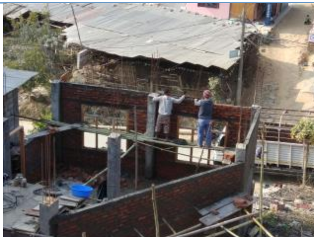
Caption: The RC frame house being constructed on Manthali Municipality has reinforcement missing on the horizontal Bands.