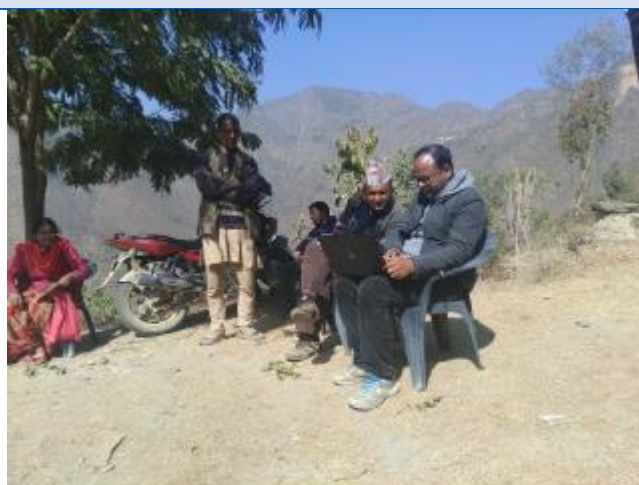
Caption: Interaction with Ward Chairperson of Bhirpani regarding the low construction rate.