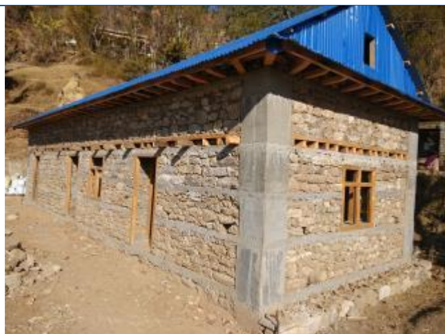
Caption: The three roomed house of Shankar Pandit, Tokarpur, of Doramba Rural Municipality. The house is being constructed using stone in cement mortar. The RC bands have been provided to the house. The RC columns have been provided on the corners. The file has been forwarded to District Support Engineer for the safety analysis.