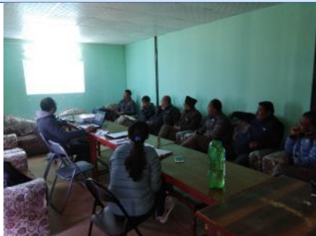
Caption: The palika level meeting at Sunapati Rural Municipality meeting Hall, Hiledevi, Sunapati.