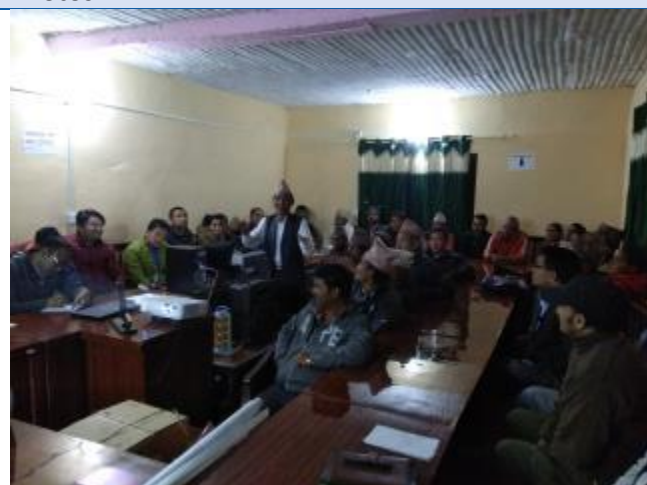
Caption: The Palika level meeting organized in the meeting hall of Khadadevi Rural Municipality in Makadum, Khadadevi Rural Municipality.