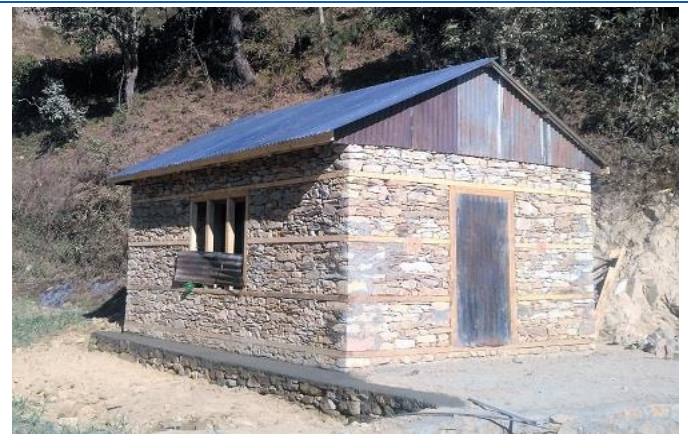
Figure 4: Stone in mud mortar with flexible roof, one story with timber band. House owner: Thirth Bahadur Bal, this house verified for second and third tranche. Tentative cost of this building is 1.5laks excluding his contribution and local material. Location is IndraSarowar RM-04.