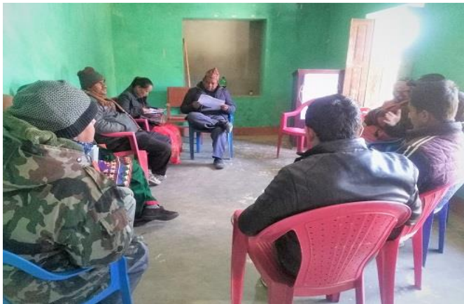
Figure 1: Technical Coordination Meeting in VDC level, Fafel, Makwanpur. And ward president briefed his team about construction rate, which info pack was provided by HRRP team.