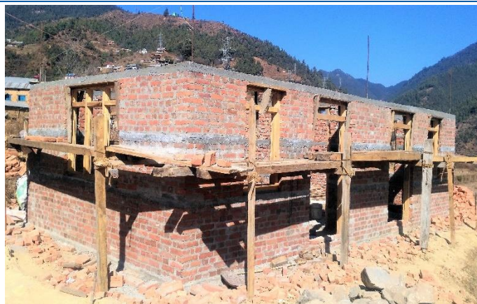
Figure 3: Brick in cement mortar with all vertical post & this house verified for second tranche. House owner: Shyam Barlami and location is Fafel-08 current IndrdaSarowar RM-05.