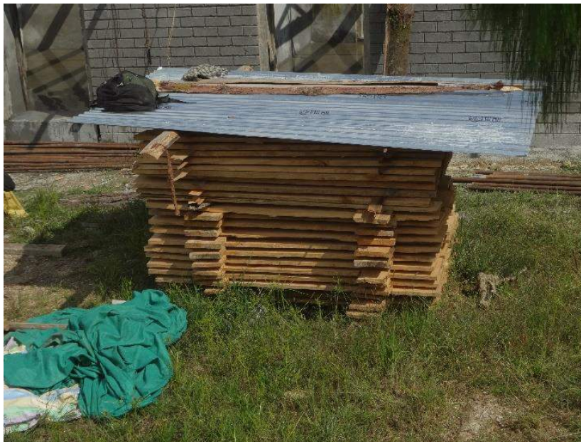
Bigu Gaupalika 3 (Bulung VDC): Timber Seasoning, generally it is done for 1 year in the locality.