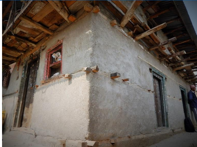
Caption: Dry stone masonry building built just after earthquake but the house was ineligible for the grant due to its length. Tamakoshi Rural Municipality, ward-02.