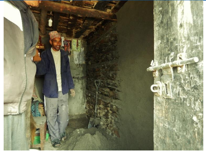
Caption: Same building in the picture beside, was corrected with the partition wall in between. Hence the owner is now eligible for the first tranche of grant