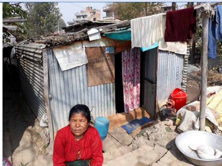
Bungamati Ward no. 22, Lalitpur Metropolitan City, Temporary shelter constructed using the CGI sheets. The beneficiary has received the 1 st tranche.