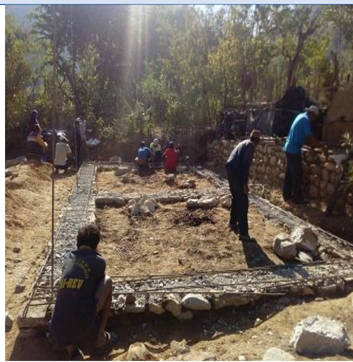
Caption: The beneficiary (Chhatra Bahadur Majhi) from Fikkal Gaunpalika-4 rebuilding the stone mud mortar house. The house is in the plinth level stage. Masons are bar binding for the DPC level. The beneficiary will receive the second tranche after casting the DPC band.